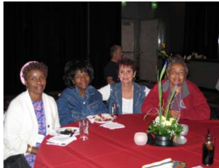
Golden West members at Reception with the Boards.