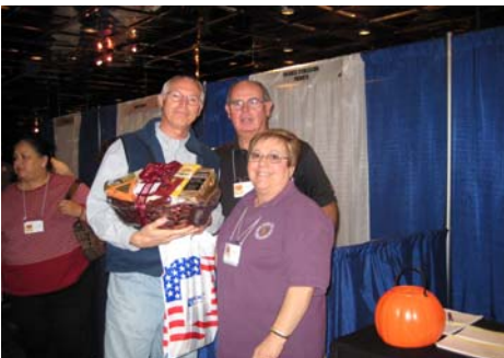
Three of many Golden West Members who won at the drawing during the Vendor Show.