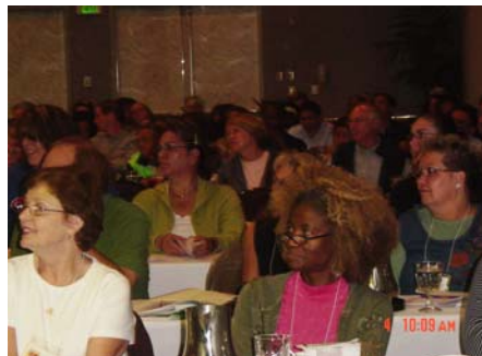
Golden West members during some of the Education Sessions.