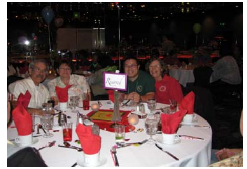
Board members at the Dinner Party.