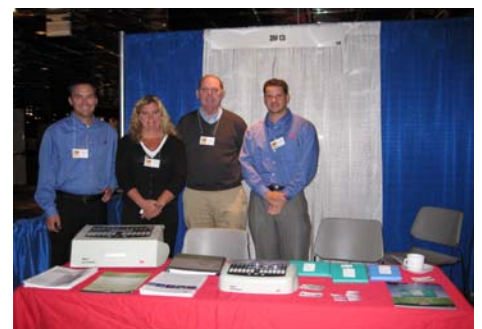
Some of our Vendors at our 2007 Golden West Seminar during the Vendor Exhibition.